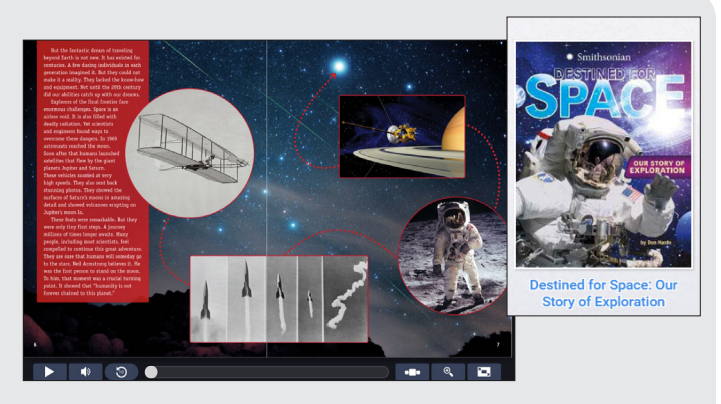
High-quality texts from respected publishers in a variety of formats and genres can be incorporated into text sets that TEA can share with students throughout the state